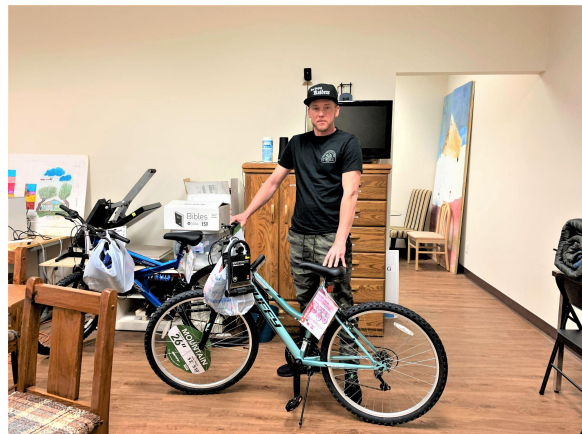
Shown is one of Cape Hope's Set Free graduates with the bicycle he earned.

Cape Hope held its first banquet, “In This Together,” event hosted at the beautiful Cape May Winery. The main purpose of this charitable event was to increase community awareness of our intention to create the Cape Hope Community Care Center.